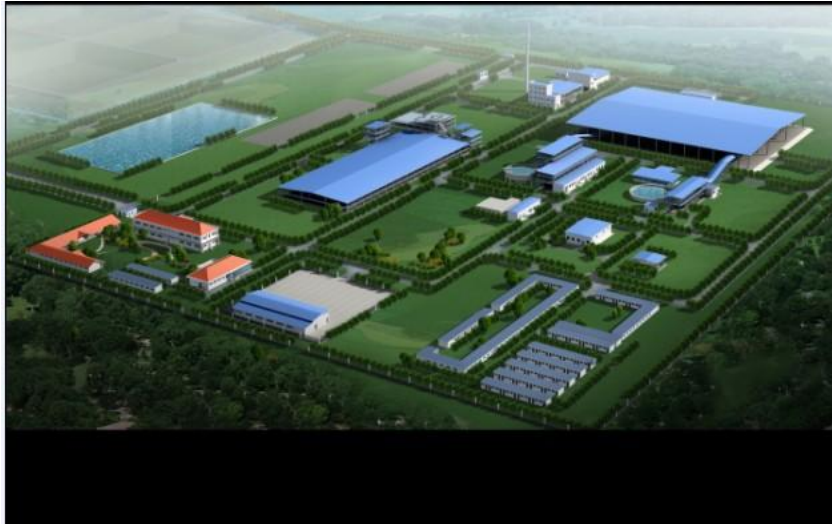
Impression Drawing for Demonstration Project in the First Stage 5