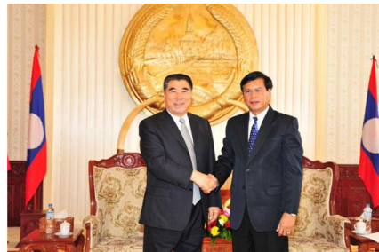
老挝总理波松梭见李成玉主任